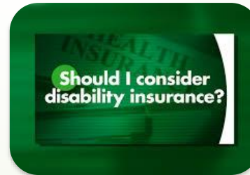
Disability insurance options